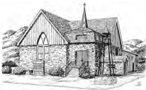
THE LITTLE STONE CHURCH ON THE HILL WITH THE BIGGEST HEART IN THE ROCKIES